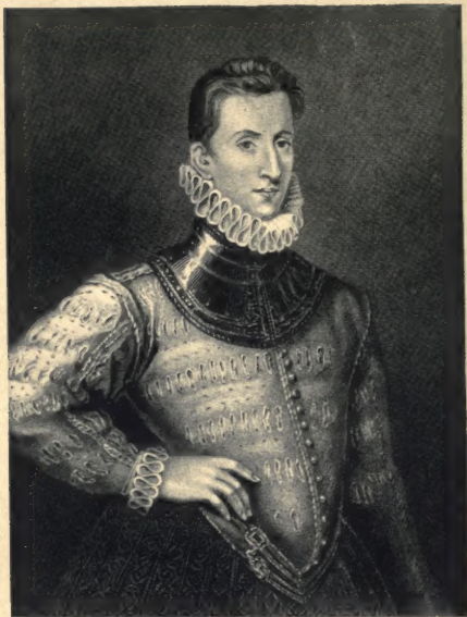
Sir Philip Sidney Sir A. More.